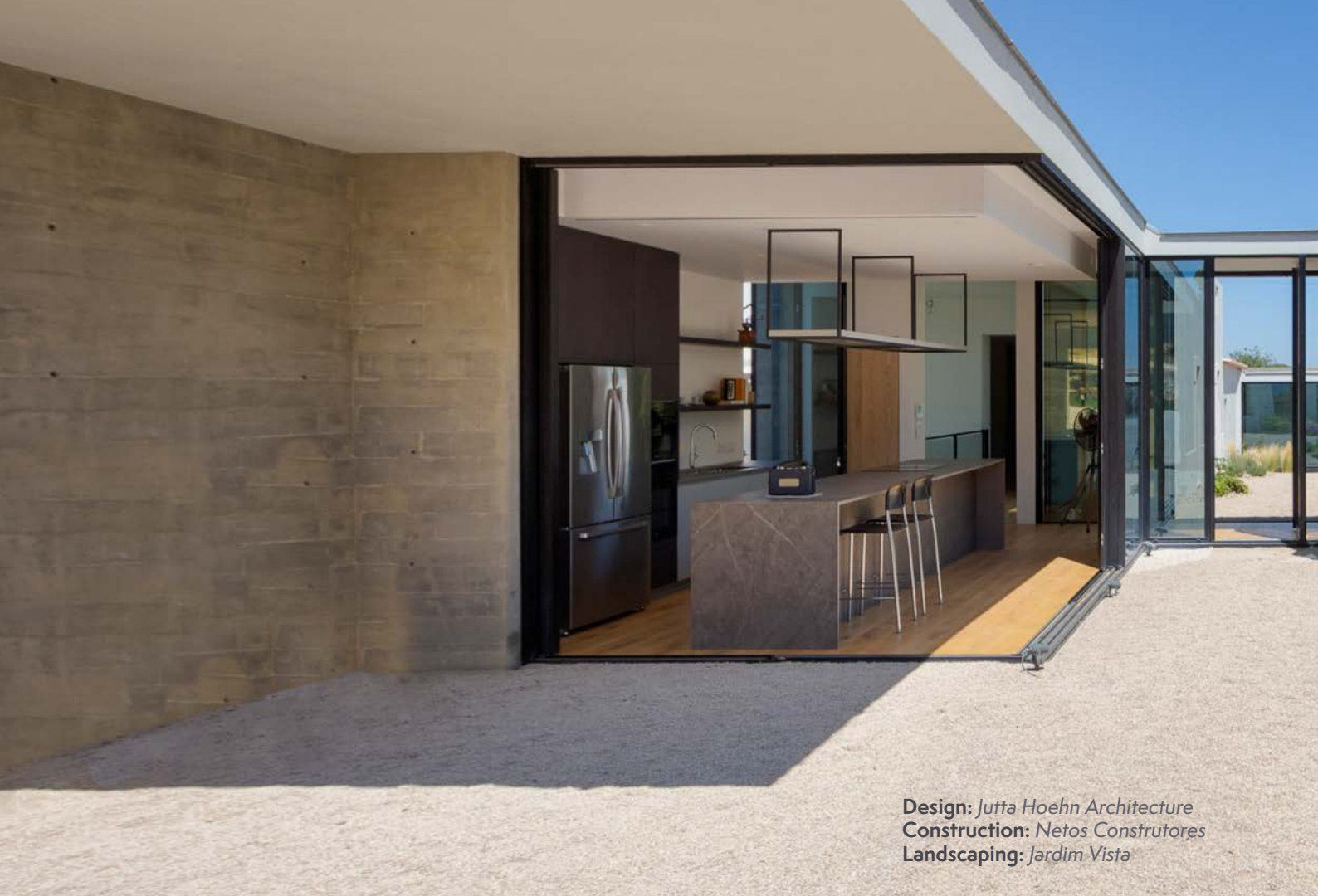
Design: Jutta Hoehn Architecture Construction: Netos Construtores Landscaping: Jardim Vista

The location of this beautiful plot is right behind Vale do Lobo, on an almost 2 hectare site. The ruin was on an agricultural reservation, which is highly restricted.